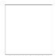
Right index fingerprint of alien removed

_____ (Signature of alien being fingerprinted)