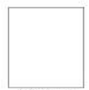
Photograph of alien removed

Port, date, and manner of removal: _____