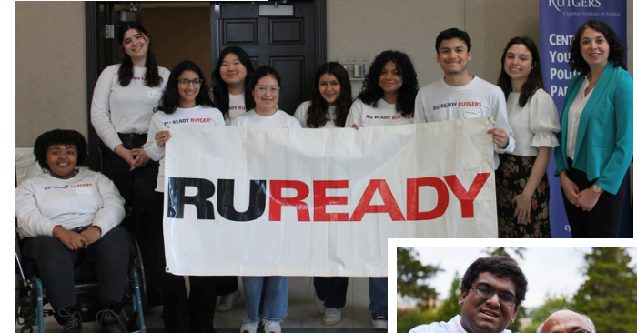
Rutgers-New Brunswick Eagleton Institute of Politics