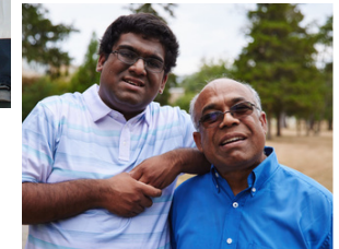
Disability Rights New Jersey