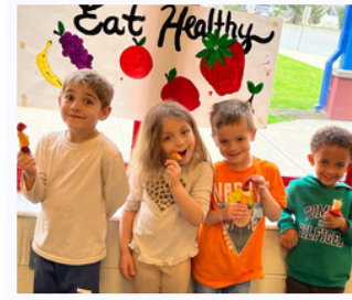
Catholic Charities, Diocese of Metuchen