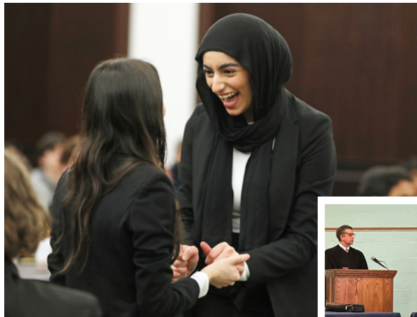
Clifton High School 2024 High School Mock Trial State Champions