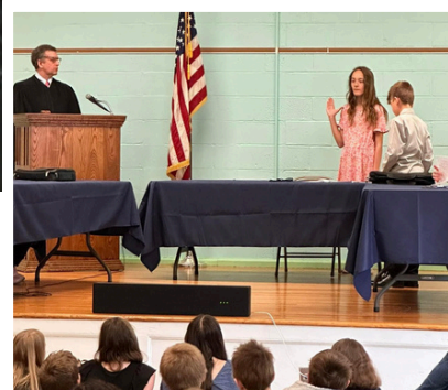
Stillwater Township Elementary School Law Fair ~ Grade 4 Honorable Mention

“ My students were so engaged in the entire Law Fair process. They embraced the challenges presented, expanded their knowledge of the justice system, and appreciated the experience of performing for their peers at the You Be the Jury event.