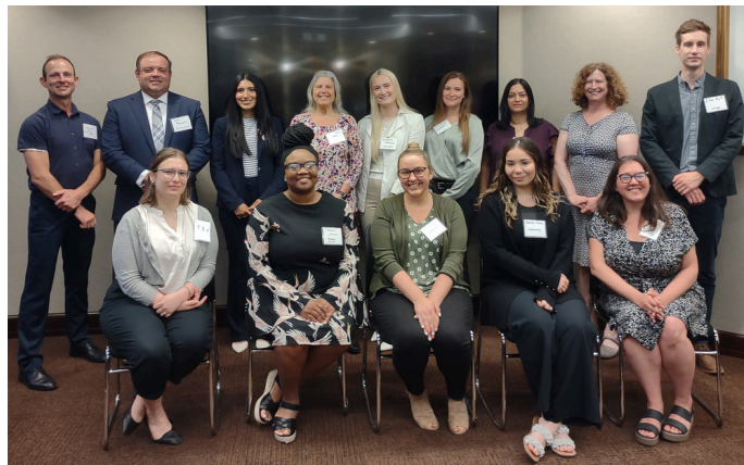
2024 SUMMER ASSOCIATES AND LAW FELLOWS

“ Helping unhoused youth was rewarding. The documents I worked on greatly sharpened my legal research and writing skills and gave me a practical application for those skills beyond that of my law school classroom. Meeting clients one-on-one was an incredibly moving experience. Being able to see the effects of my work in real time... (reminds) me of the incredible impact attorneys can have on their community. ”