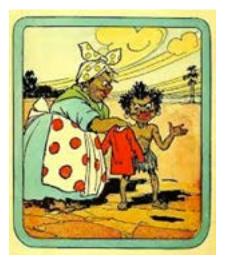
The cartoon character "Little Black Sambo," shows Black women and children in an unfair and inaccurate way.