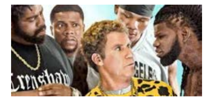
Black men are often feared as being dangerous or threatening. This is not true.

Character Jim Crow was thought to be lazy, silly and unintelligent.