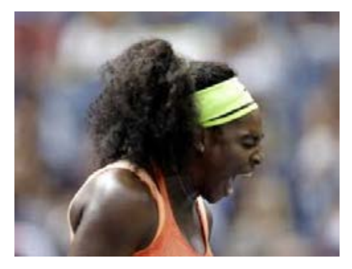
Black women are often stereotyped as being angry. This is a misrepresentation of Black women.