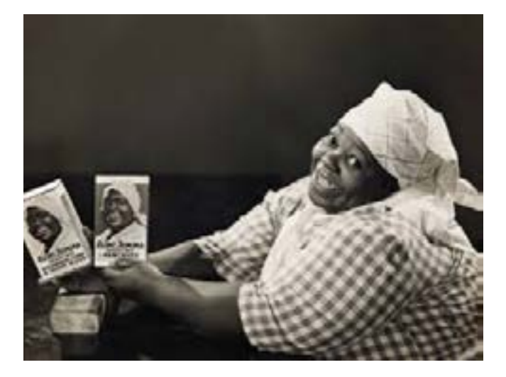
Aunt Jemima, seen on pancake boxes and packages, reminded people of the "mammy" figure from slavery.