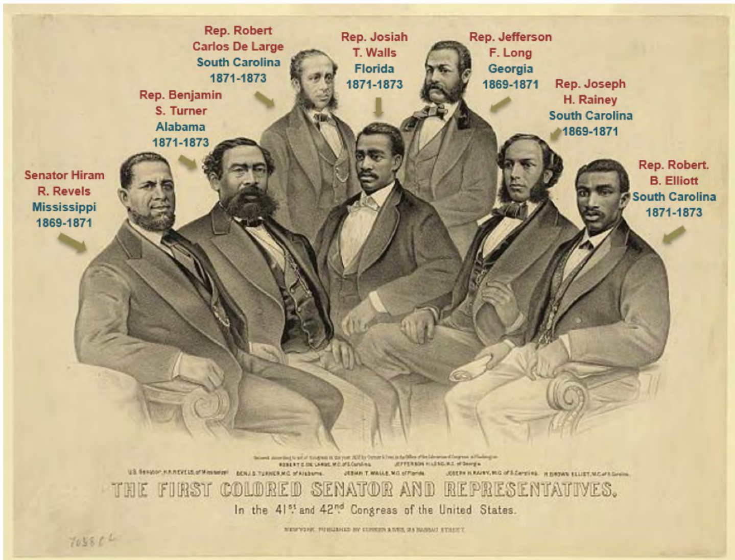
SOURCE: The First Colored Senator and Representatives—in the 41st and 42nd Congress of the United States. Color film copy slide. Library of Congress, Washington, D.C., https://www.loc.gov/resource/ppmsca.17564/ .