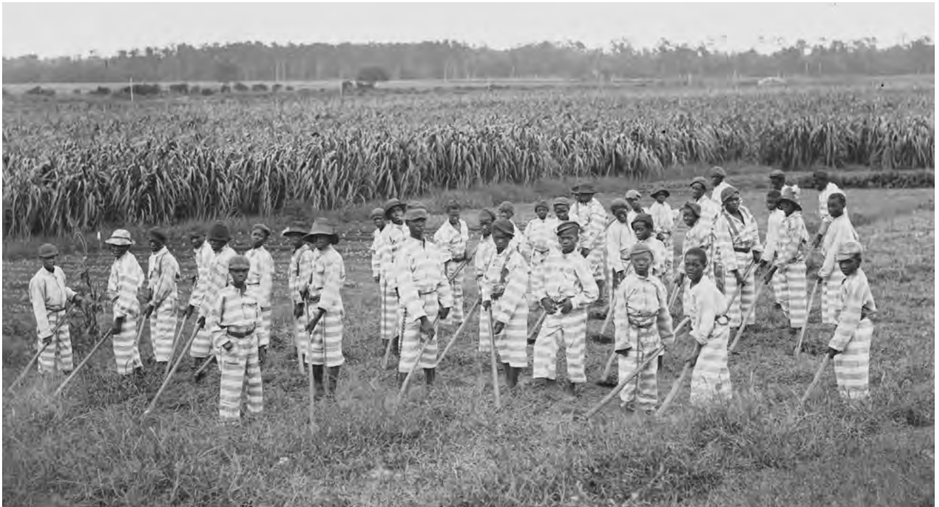
Juvenile convicts at work in the fields, 1903