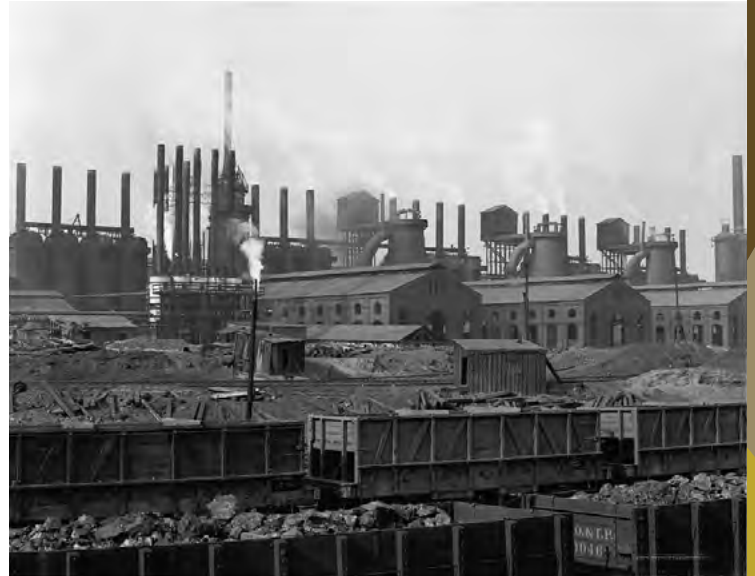
Tennessee Coal, Iron & Railroad Company furnaces, Ensley, Alabama

Businesses like Tennessee Coal desired cheap labor to grow their industries and keep profits high. At the same time, southern states were desperate for funds to rebuild their economies in the decades following the Civil War. The passage of racist Jim Crow laws in those states led to the arrests of record numbers of Black people, who were