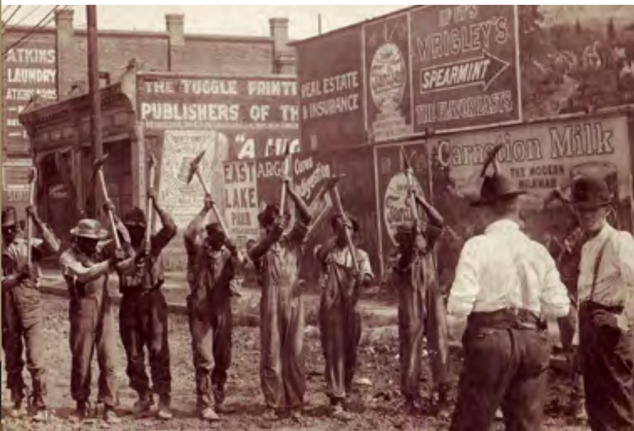
Guards watch over a group of convict-lease prisoners in Birmingham. Alabama's convict-lease system existed from 1875–1928.