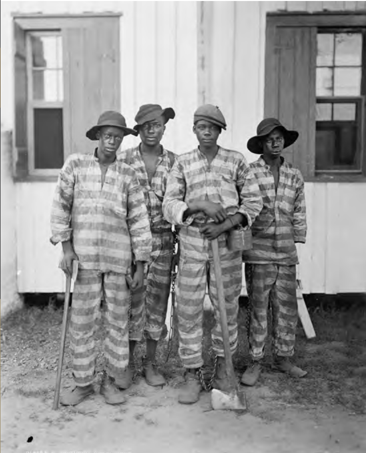
Members of a southern chain gang, between 1900 and 1906.

In the mines, the prisoners performed back-breaking labor for six long days each week, and rarely saw the sun rise or set. People like Cottenham were forced to remove as much as eight tons of coal each day from the mines. Failure to meet this requirement led to severe punishments, including dozens of lashes with a whip that ripped the skin from the backs of its victims. At night, the prisoners were locked in a wooden barracks, 200 worn-out bodies chained to one another in a single chamber. Those who tried to escape were fixed with iron shackles, cuffs, collars, balls and chains.