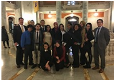
North Bergen High School Mock Trial Team