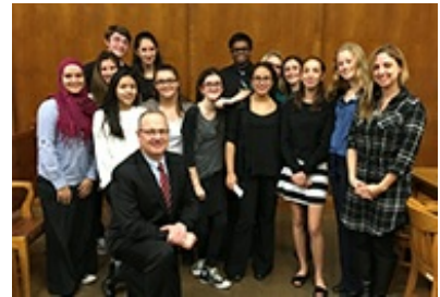
Lyndhurst High School Mock Trial Team