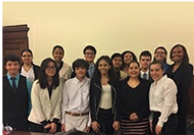
Weehawken High School Mock Trial Team